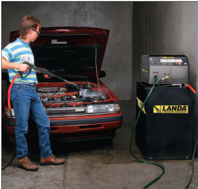
The EHW, with its auto start-stop feature, can generate a high-pressure, hot water spray on demand simply by pulling the trigger on the gun.