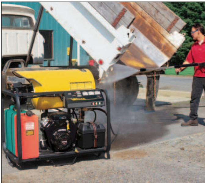
There are three models of the PGDC, which is designed to handle the toughest of outdoor cleaning jobs.